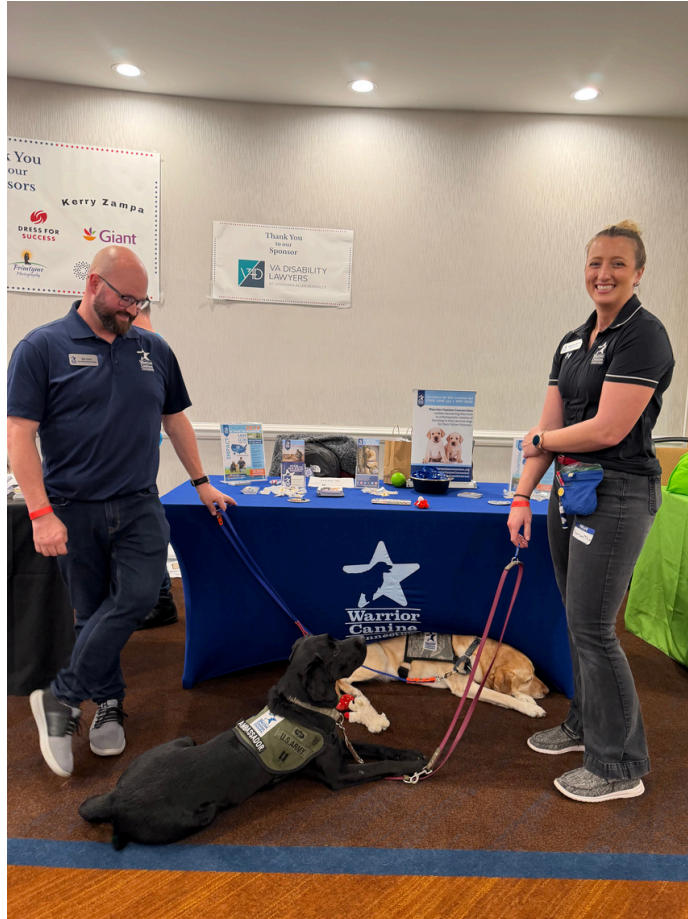
Thank you to Warrior Canine