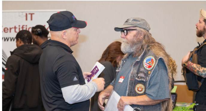
Thank you to Metropolitan Washington Airports Authority