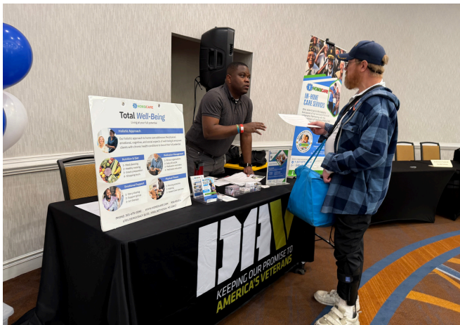
Thank you to DAV